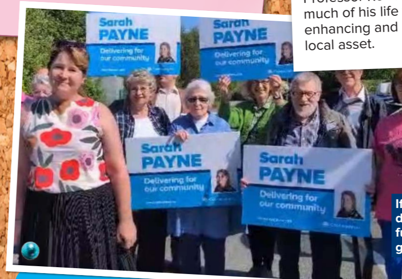
If you can lend a hand during this campaign or in future, you'll be part of a growing team...

Since 2010, the number of businesses in Wirral has risen from 6,760 to 8,770, creating new jobs and apprenticeships. Now that inflation is falling, we will reduce taxes on business and jobs, and make it easier to get back into work.